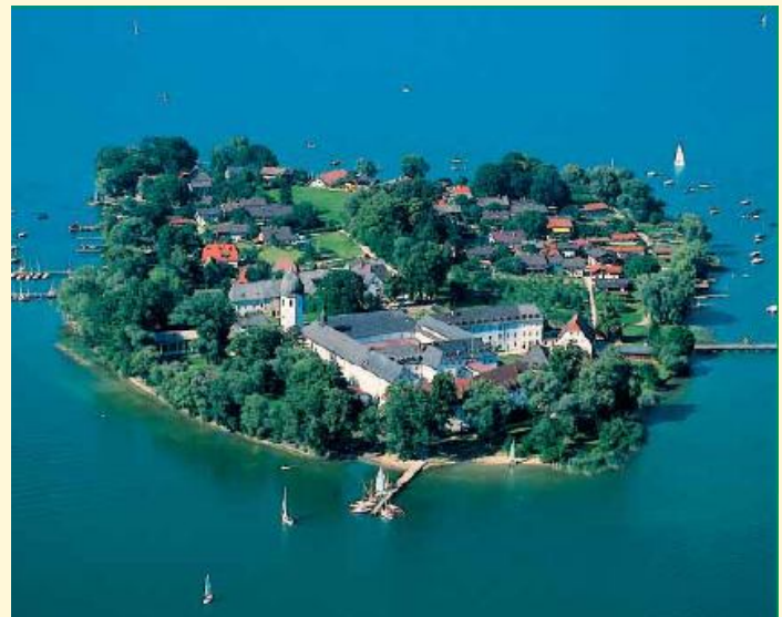
The Fraueninsel, where the EES Summer School will be held. Located southeast of Munich in Chiemsee.